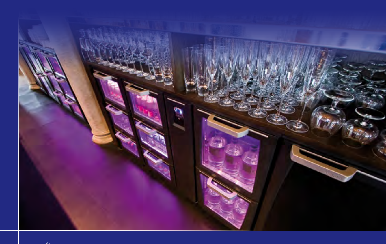
Flexbar... A unique concept!