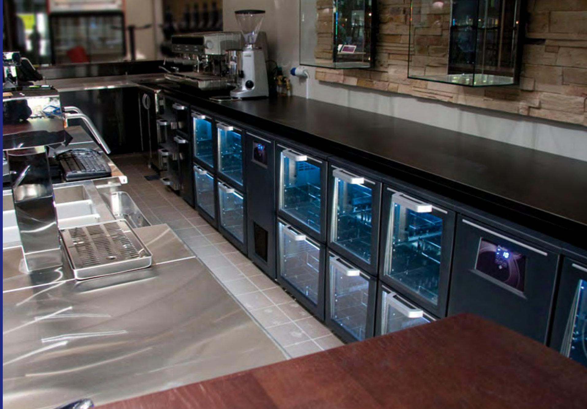
Emil & Samuel Restarant from Steen & Strøm Maga-zin in Oslo (Norway) has recently started using a new

The bar consists of a cooled section with glass drawers complete with EQUAL-LED and an uncooled section for storing dishwasher shelves and a coffee knock box drawer under the coffee machine.