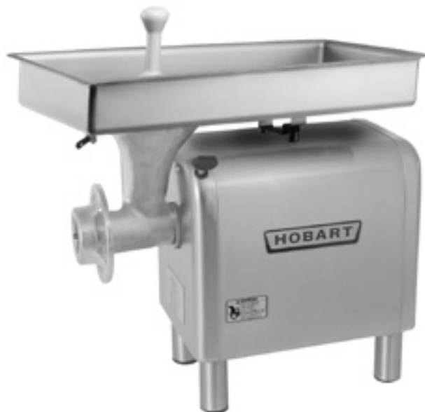
4822 with Optional Funnel Shaped Cylinder